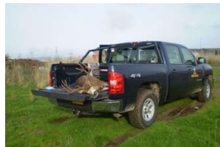
This trophy blacktail was one of several poached in southern Oregon in December.

another 2x2 buck that was wounded in the pasture next to where the 4x4 buck was found. The responding trooper had to put the deer down due to the nature of its injury. The second deer's meat was salvaged and taken to a butcher shop in Eagle Point to be donated to area food banks.